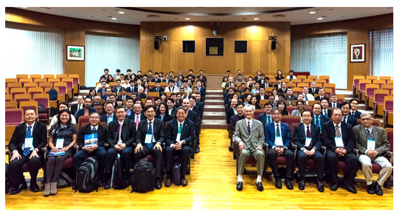
AOTULE Conference, November 2019, Ookayama Campus, Tokyo Institute of Technology

The Asia-Oceania Top University League on Engineering (AOTULE), founded in 2007, is a league of 13 premier engineering universities within Asia-Oceania region. The AOTULE promotes inter-university cooperation through joint programs including an annual Dean's meeting, student workshop and exchanges of students and staff, in order to improve the quality of engineering education and research of the members. It aims to broaden participating students' perspectives through education, research and cross-cultural interactions (excerpts from AOTULE website).