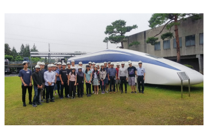
Railway Technical Research Institute Visit

Ookayama Campus 2-12-1 Ookayama, Meguro-ku, Tokyo Suzukakedai Campus 4259 Nagatsuta-cho, Midori-ku, Yokohama, Kanagawa