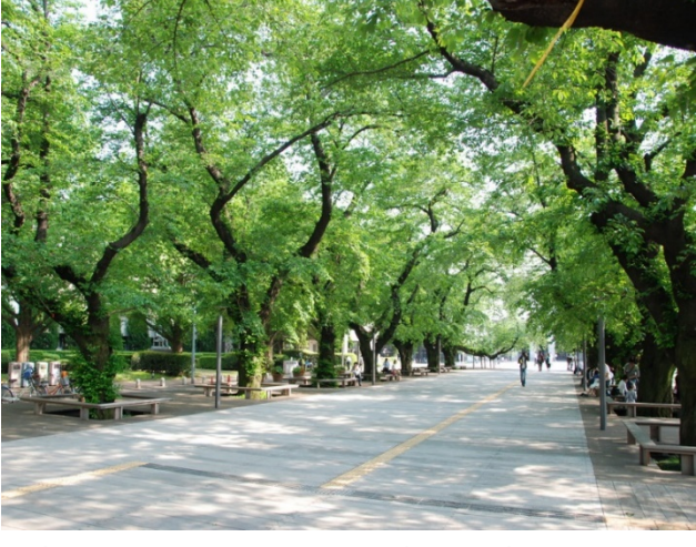
Cherry Tree Promenade, Ookayama