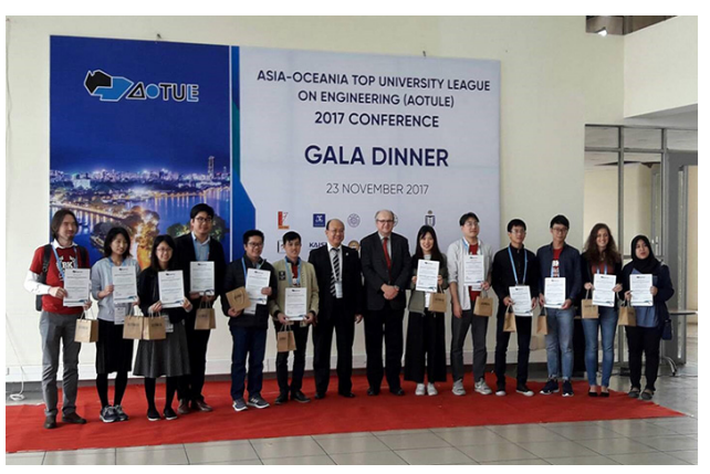
AOTULE Conference 2017 Hanoi University of Science and Technology