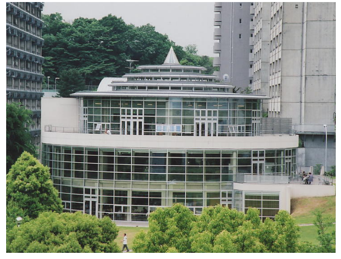
Suzukakedai Campus, Yokohama