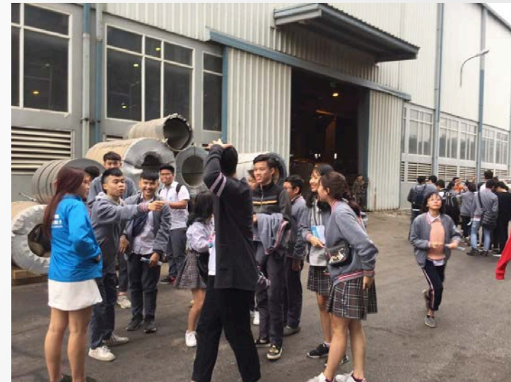
One-day Job Shadowing