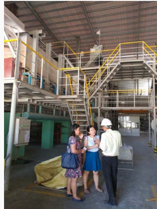
Interviews about Jobs