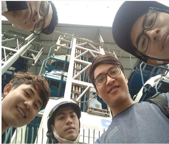
Observation in Public Space