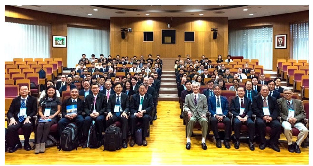
AOTULE Conference, November 2019, Ookayama Campus, Tokyo Institute of Technology

The Asia-Oceania Top University League on Engineering (AOTULE), founded in 2007, is a league of 13 premier engineering universities within Asia-Oceania region. The AOTULE promotes inter-university cooperation through joint programs including an annual Dean's meeting, student workshop and exchanges of students and staff, in order to improve the quality of engineering education and research of the members. It aims to broaden participating students' perspectives through education, research and cross-cultural interactions (excerpts from AOTULE website).