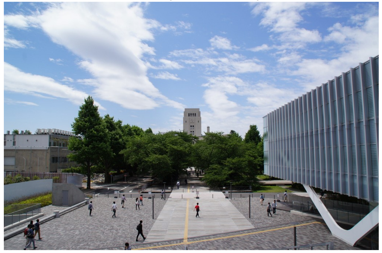
Main Building & Library, Ookayama Campus, Tokyo

Period: Sat 1 June, 2024 – Sat 31 August, 2024 Venue: Tokyo/Yokohama, Japan